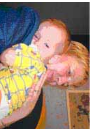
Russian worker at the Lutheran Crisis Pregnancy Center in Novosibirsk, Siberia, cradles a young child who was saved from abortion.

This rare and revolutionary program in Russia has touched the lives of more than 16,000 women. Another partnership project is with St. Andrew Lutheran Church in Novosibirsk, a large urban area in Siberia. Workers at this church have opened the region's first crisis pregnancy and post-abortion counseling center in the area's